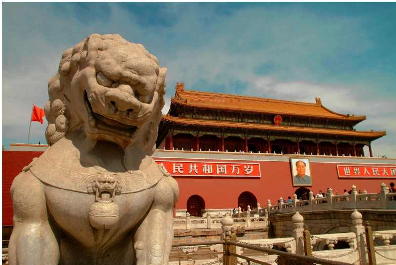
The Gate of Heavenly Peace in Beijing’s Tiananmen Square, the site of pro-democracy demonstrations in 1989.

Predicting the demise of authoritarian regimes is a risky business. Few Western experts forecast the collapse of the Soviet Union before it occurred in 1991; the CIA missed it entirely. The downfall of Eastern Europe’s communist states two years earlier was similarly scorned as the wishful thinking of anticommunists—until it happened. The post-Soviet “color revolutions” in Georgia, Ukraine and Kyrgyzstan from 2003 to 2005, as well as the 2011 Arab Spring uprisings, all burst forth unanticipated.