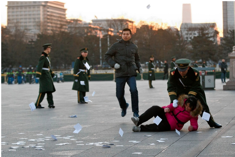
A protester is pushed to the ground by a paramilitary policeman March 5, 2014, in Beijing before the opening of the National People’s Congress nearby.

A more secure and confident government would not institute such a severe crackdown. It is a symptom of the party leadership’s deep anxiety and insecurity.