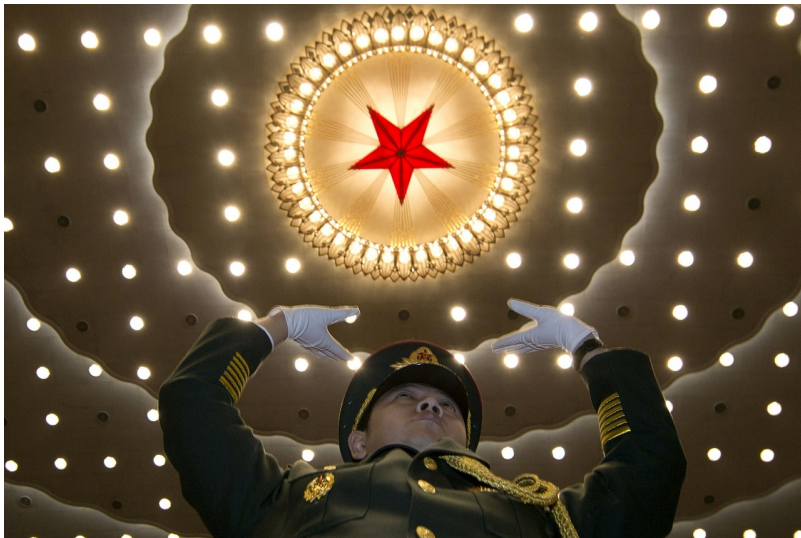
A military band conductor during the opening session of the National People's Congress on Thursday at the Great Hall of the People in Beijing.

Consider five telling indications of the regime's vulnerability and the party's systemic weaknesses.