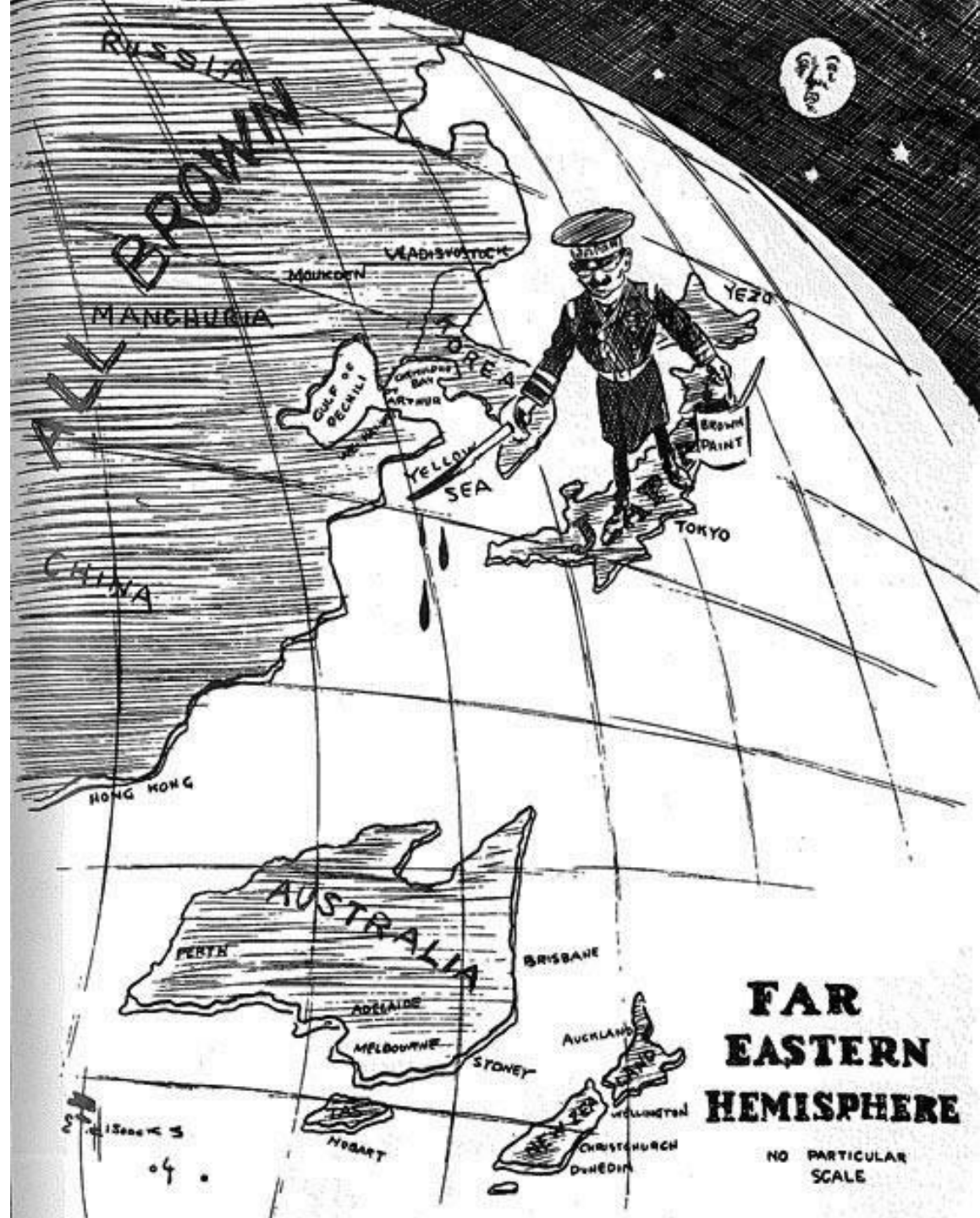
E.F. Hiscocks in 1904