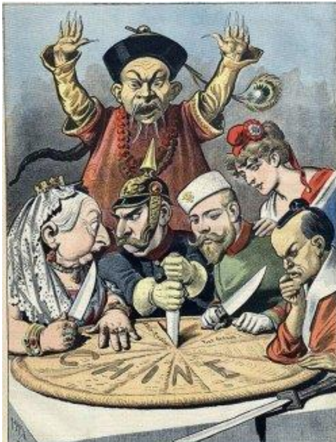
published in Le Petit Journal Jan. 16th, 1898.